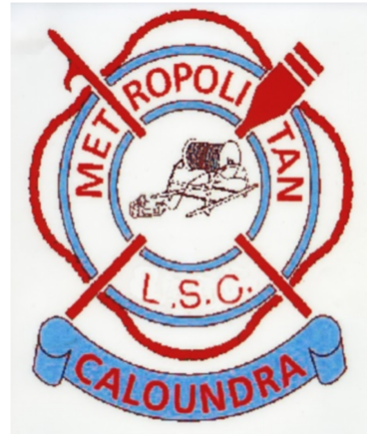
Club Badge 1933 to 1988